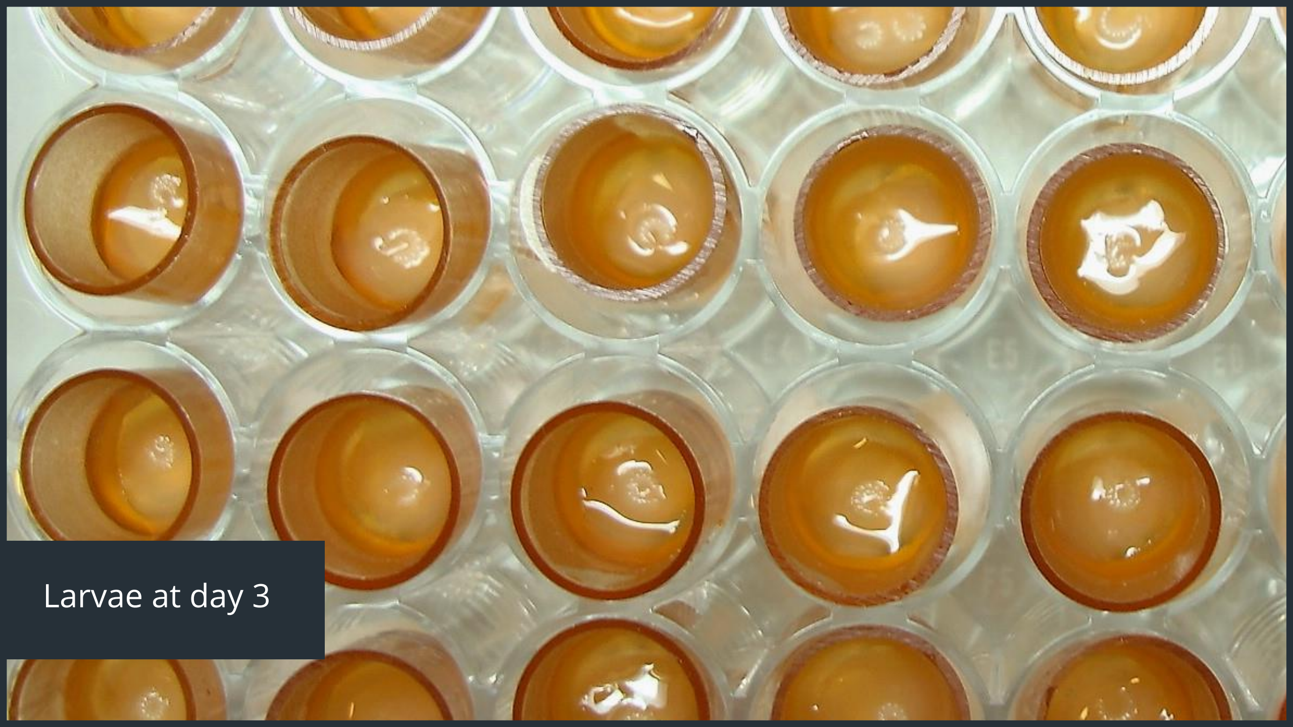
Larvae at day 3