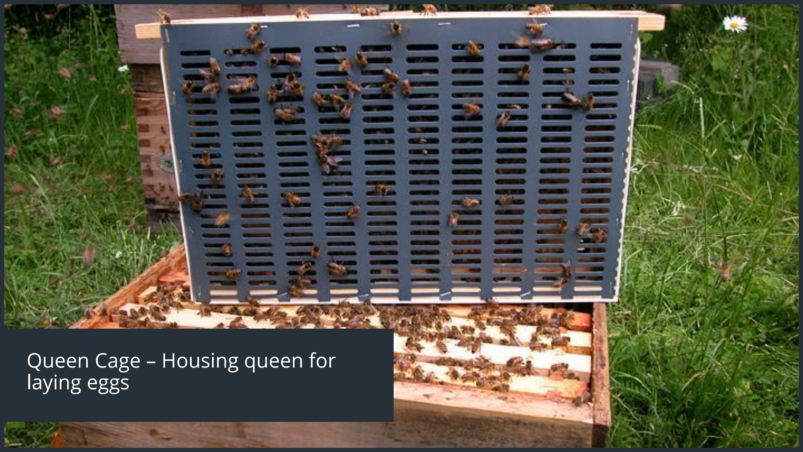
Queen Cage – Housing queen for laying eggs