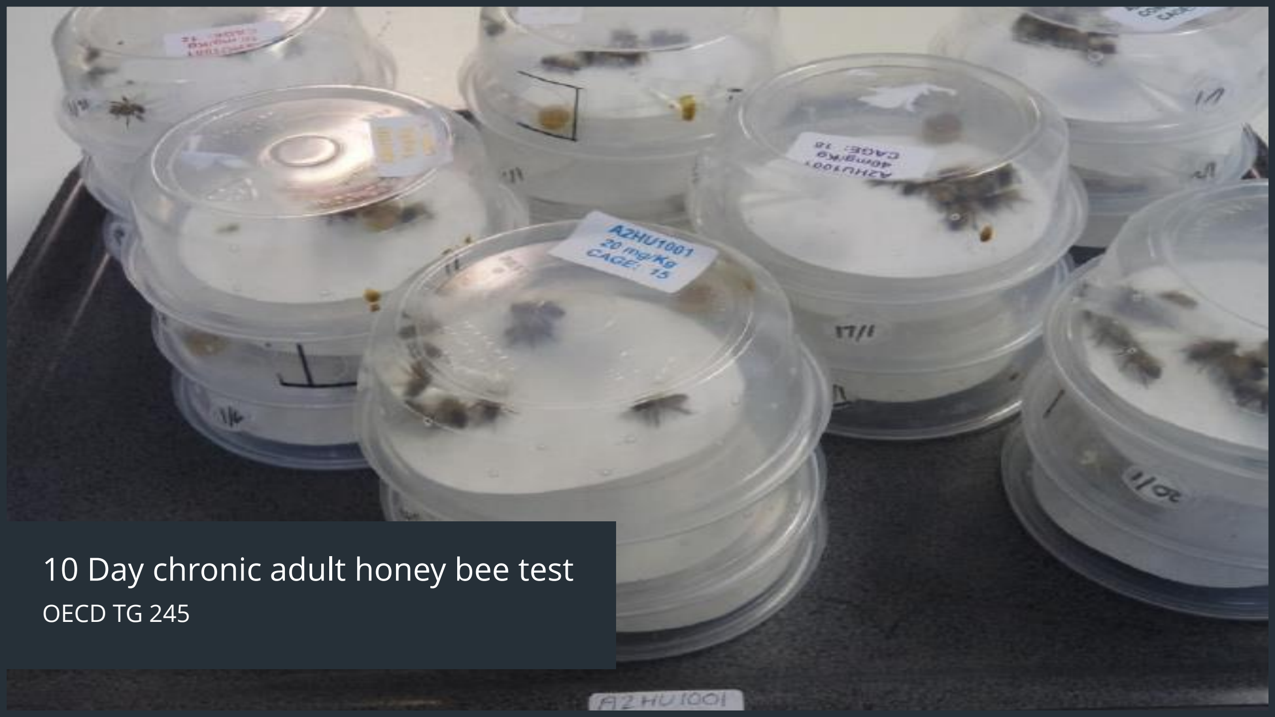
10 Day chronic adult honey bee test OECD TG 245